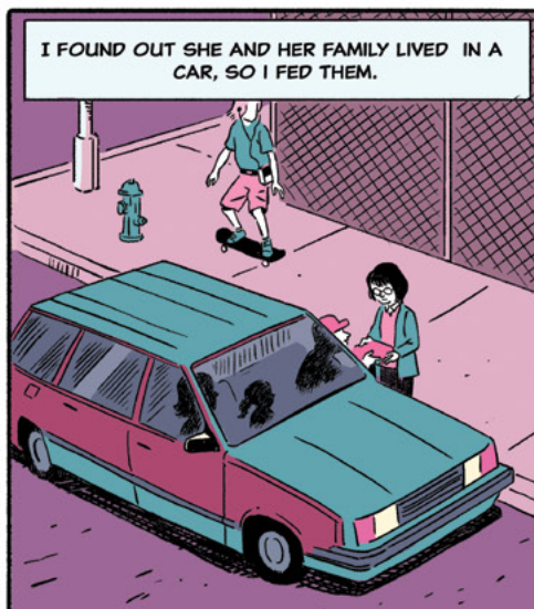
I FOUND OUT SHE AND HER FAMILY LIVED IN A CAR, SO I FED THEM.