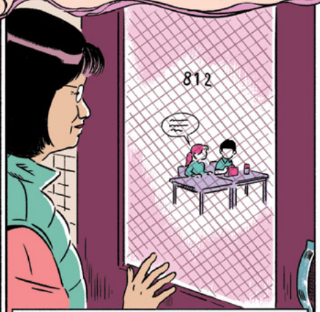
YEARS LATER, I GOT MARRIED, AND WORKED AT A SCHOOL IN EUREKA, CALIFORNIA.