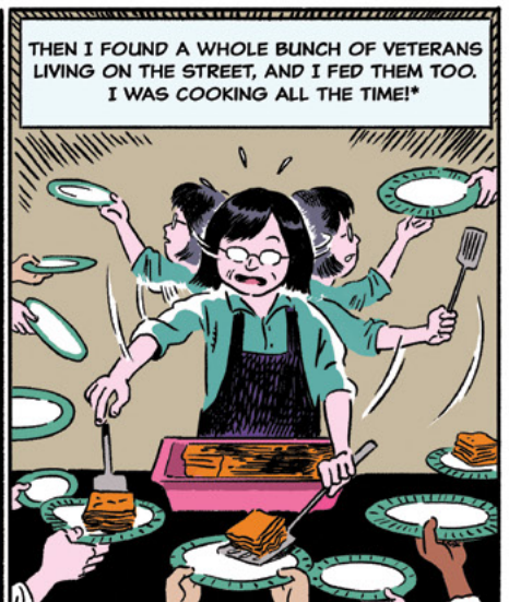
THEN I FOUND A WHOLE BUNCH OF VETERANS LIVING ON THE STREET, AND I FED THEM TOO. I WAS COOKING ALL THE TIME!*