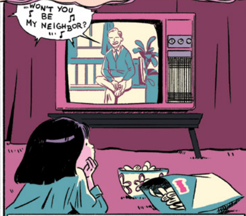
I WAS ALWAYS BAREFOOT IN CHINA, BUT MR. ROGERS TAUGHT ME HOW TO PUT SHOES ON MY FEET.