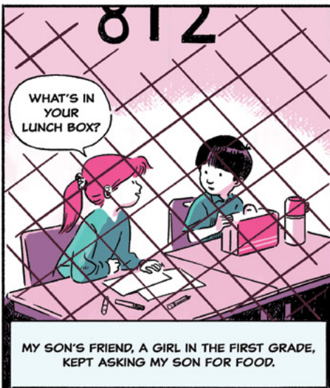
MY SON'S FRIEND, A GIRL IN THE FIRST GRADE, KEPT ASKING MY SON FOR FOOD.