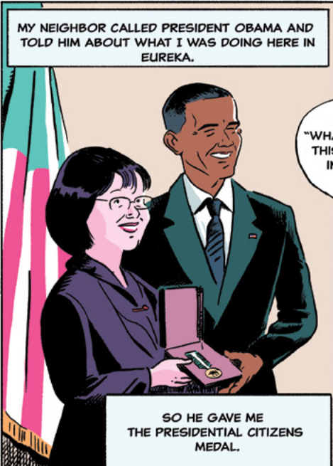
MY NEIGHBOR CALLED PRESIDENT OBAMA AND TOLD HIM ABOUT WHAT I WAS DOING HERE IN EUREKA.