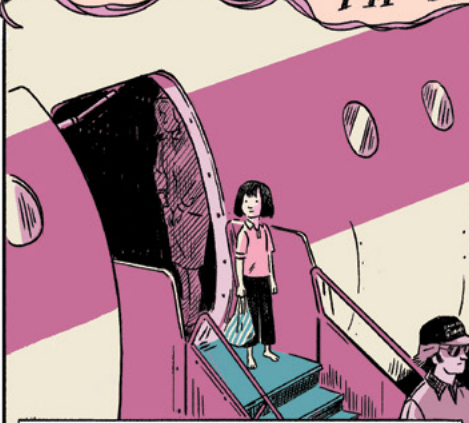
THE BIGGEST MEMORY FOR ME IS COMING OUT OF THE AIRCRAFT AND HEARING THE SONG "BRIDGE OVER TROUBLED WATER."

"SAIL ON SILVER GIRL, SAIL ON BY, YOUR TIME HAS COME TO SHINE, ALL YOUR DREAMS ARE ON THEIR WAY, SEE HOW THEY SHINE. OH, IF YOU NEED A FRIEND I'M SAILING RIGHT BEHIND"