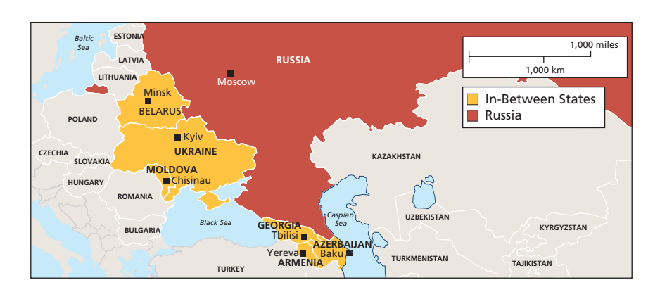
Figure 1.1 Map of the Region

tion of current and future EU laws and rules into the domestic legislation of signatories. (Azerbaijan, which mostly trades in hydrocarbons, remains unassociated with either bloc.) The EAEU and EU trading regimes are incompatible, and there is no regular dialogue between the respective commissions of the blocs. In-between states have been faced with an either-or dilemma, and economic ties between those states and one or the other bloc have degraded as a result. The long-standing negotiations for addressing the regional conflicts have been ongoing for years (in some cases, for decades) with only modest progress on conflict management and no prospects of achieving settlements. In large part, that has been a function of the interlinkage between the conflicts and other elements of the dispute over the regional order. Meanwhile, the panregional mechanisms designed to create order in all three arenas—e.g., the Organization for Security and Co-operation in Europe—have manifestly failed to achieve their mission and are largely deadlocked.